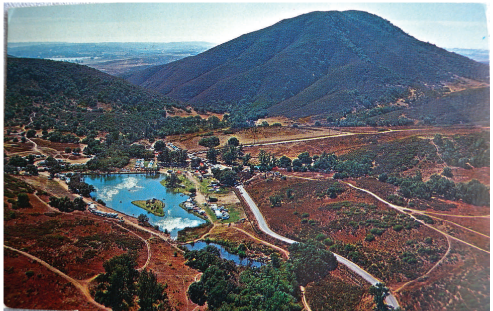
Elfin Forest Harmony Grove—Elfin Forest Vacation Ranch circa 1960. “One of San Diego County’s finest family recreation spots.”